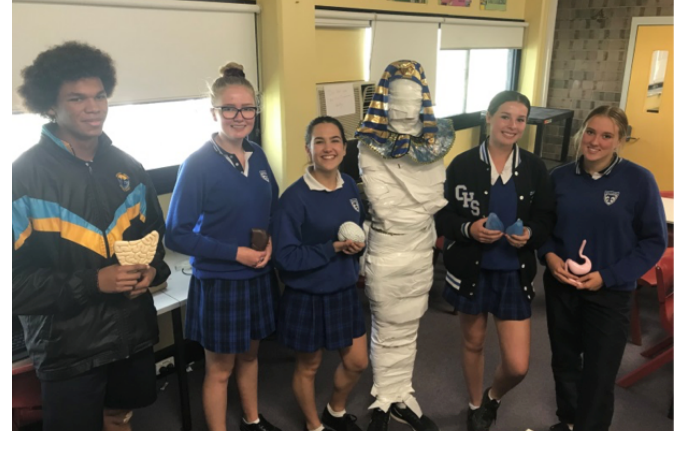
His organs are removed and all is ready for him to be taken to his tomb in the Valley of the Kings on the west-bank of the Nile River.