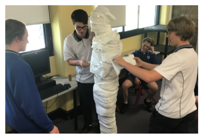
The Pharaoh is dead! We only have a short time to get him to the after-life

Additionally, the students were given the task of laying-out a full scale recreation of his tomb and burial chamber – which incidentally, was the only room in his tomb that was decorated. What follows is a snapshot of the class' experiences and achievements.