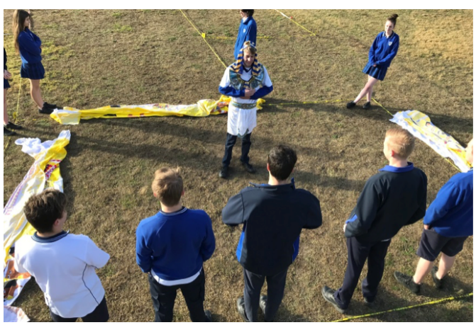
Tut gives his ushabtis (afterlife servants) last minute instructions before leaving his tomb.